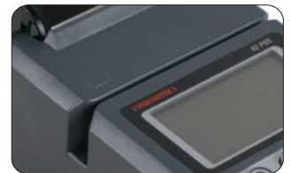
Magnetic Swipe Card Reader