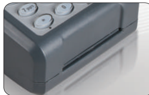
Smart Card Reader