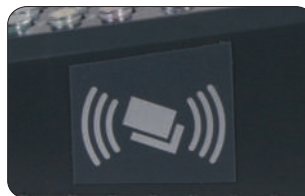
NFC / Contactless Reader